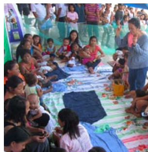
Arugan volunteers helping mothers to breastfeed and make appropriate complementary foods.

Operational Guidance on Infant and Young Child Feeding in Emergencies , v2.1, Feb 2007 www.ennonline.net/resources/6 http://ibfan.org/infant-feeding-in-emergencies/125 http://www.ibfanasia.org/ife/unicef_media_joint-statement.pdf A first hand account from Velvet Here: http://info.babymilkaction.org/velvet Groups urge breast milk for babies in storm shelters , Inquirer News. goo.gl/sCffm7